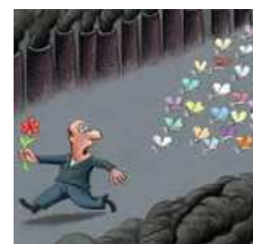
Where have all the flowers gone?

Are you an aspiring cartoonist? Perhaps you'd like to send us some material for the next newsletter...? See back page for details of where to send material.